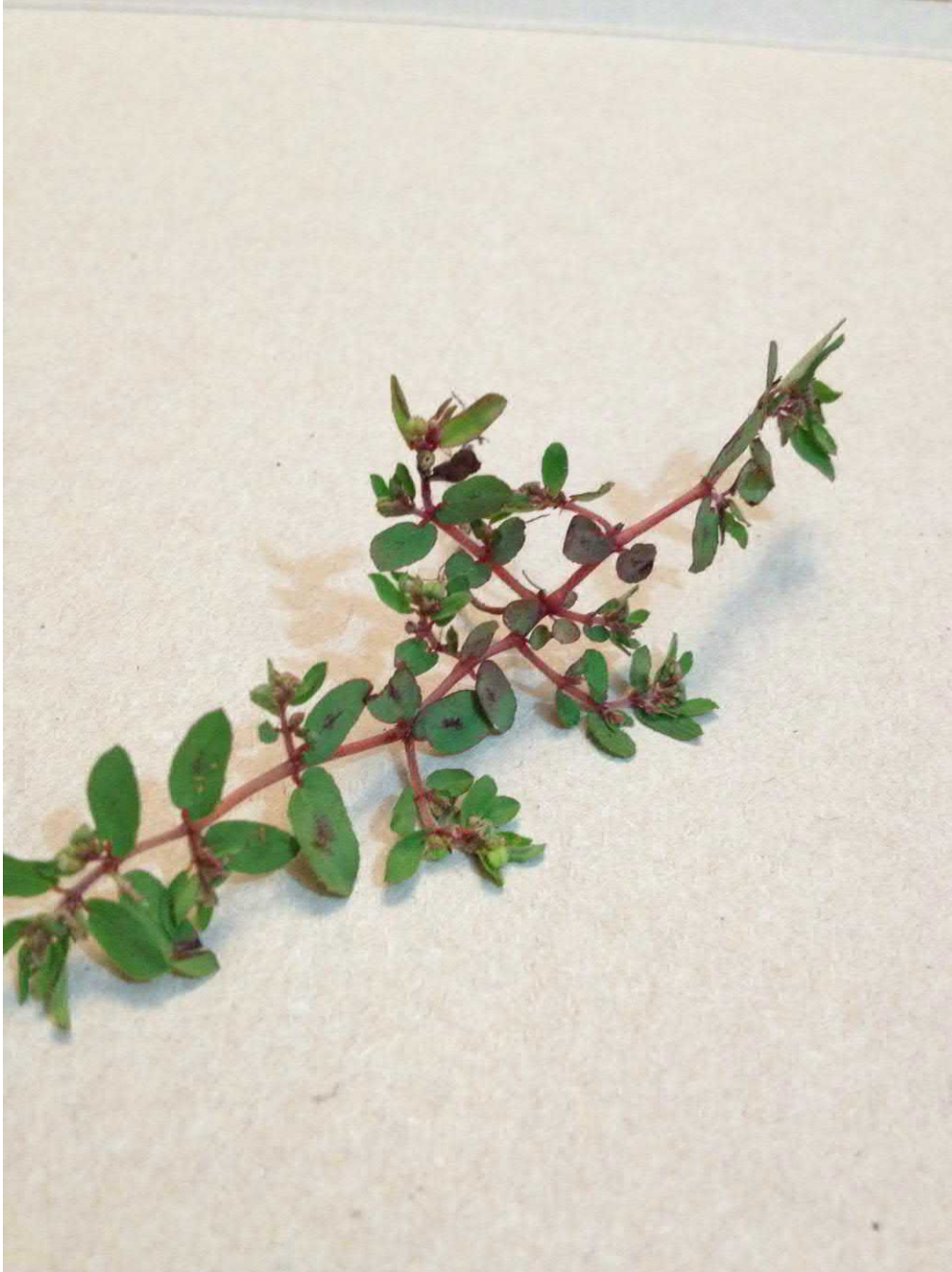
Euphorbia maculata