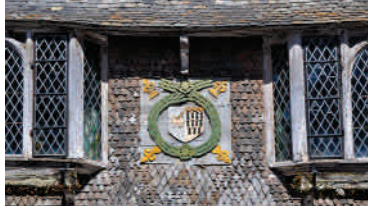
Tudor House facade