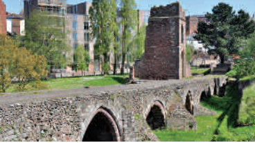
Medieval Exe Bridge