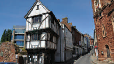
'The House that Moved'